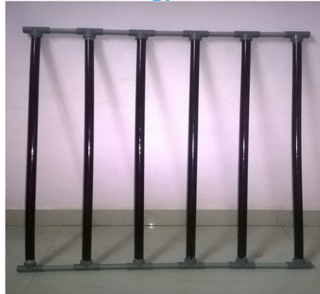
Fig. 1 Column of plastic pipes

2) Plastic bottles in each column: Transparent plastic bottles of soft drinks like Pepsi and Miranda are used. Length of bottles is 35 cm and are cut 5 cm from its end allowing 10 cm of the bottle to enter in the next bottle, repeating the operation for as many columns required. Then insert these the bottle columns in the pipe coated with black paint which acts as heat absorber. Seal the top bottle of each column so that the heat is not lost and allow the air to enter from bottom. The air gets heated and trapped in the bottles which in turns heats the pipe.