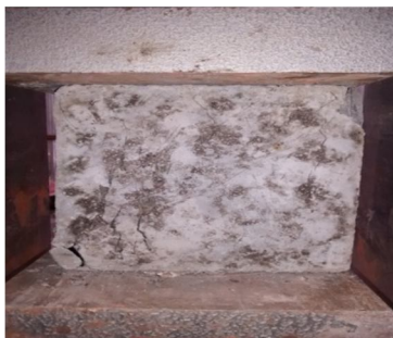
Fig. 3.11 Cube under compression

This test is performed in compression testing machine. The cubical moulds of size 15cm x 15cm x 15cm are used to perform this test. In this test the concrete is poured into the mould and tempered properly so as to avoid any voids. After 24 hours these moulds are removed and test specimens are put in water for curing. The top surface should be even and smooth. These specimens are tested by compression testing machine after 7 days curing or 28 days curing by applying load gradually at the rate 140kg/cm per minute till the specimen fails. Load at the failure divided by area of specimen gives the compressive strength of the rubberized concrete. The procedure is for plain concrete and same procedure is repeated same for sodium hydroxide (NaOH) treated mixture and cement paste treated mixture as well as for untreated mixture Fig. 3.11 shows the cube under compression and table 3.8 shows compressive strength of different samples.