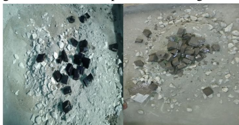
Fig. 3.2 NaOH-treated and Cement paste-treated Rubber

The treatment to the rubber aggregate particles before being used into the casting of samples are the surface treatment with one molar sodium hydroxide and cement paste. One molar of NaOH solution is prepared and the rubber particles are dipped in the solution for almost 20 minutes before being used in the concrete. Same procedure is adopted in case of the treatment with cement paste in which cement and water is mixed to form a thick paste and then rubber particles are kept soaked in it for almost 20 minutes before being used in the concrete. These treatments are done in order to improve the surface characteristics of the rubber particles so that its bonding with cement in the concrete gets enhanced to impart better strength to the hardened concrete.