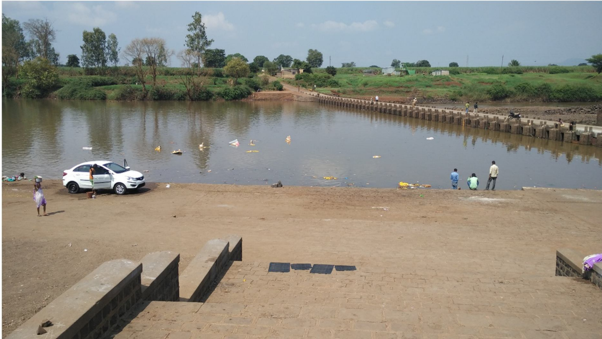
Figure 2. Rajaram Bandhara Kolhapur district Maharashtra India