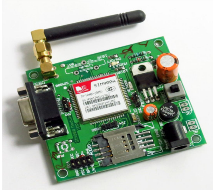
Figure: 3. GSM SIM 900 Module [5]

A GSM represents Global System for Mobile. In a GSM Module a GSM Modem is associated with a PCB and a different number of yields are taken from the module. There are various GSM modules accessible in the market out of which we have chosen SIM 900 for our venture. In SIM 900, the term 900 speaks to that the correspondence is upheld in 900MHz band as the majority of the versatile systems work in 900MHz ISM band.