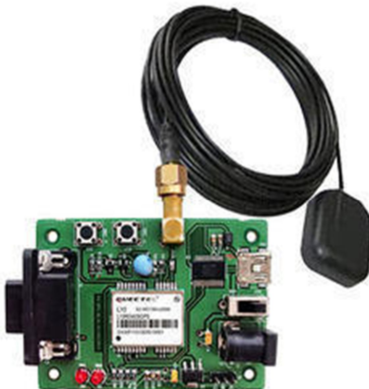
Figure:4. GPS Module

The Global Positioning System (GPS) is a satellite based route framework comprises of a system of 24 satellites situated into space. The framework gives basic data to military, common and business clients around the globe and which is unreservedly available to anybody with a GPS collector. GPS works in any climate conditions at anyplace on the planet. Ordinarily no membership expenses or framework charges to use GPS. A GPS beneficiary must be bolted on to the flag of in any event three satellites to evaluate 2D position (scope and longitude) and track development. With at least four satellites in sight, the recipient can decide the client's 3D position (scope, longitude and elevation). Once the vehicle position has been resolved, the GPS unit can decide other data like, speed, separation to goal, time and other. GPS collector is utilized for this examination work to identify the vehicle area and give data to mindful individual through GSM innovation.