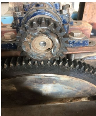
Fig. V: Gear assembly