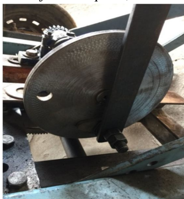
Fig. VII: cam arrangement

In our cam we have two holes depending on depth of injection required, i.e. from center of shaft 75 mm and 85 mm.