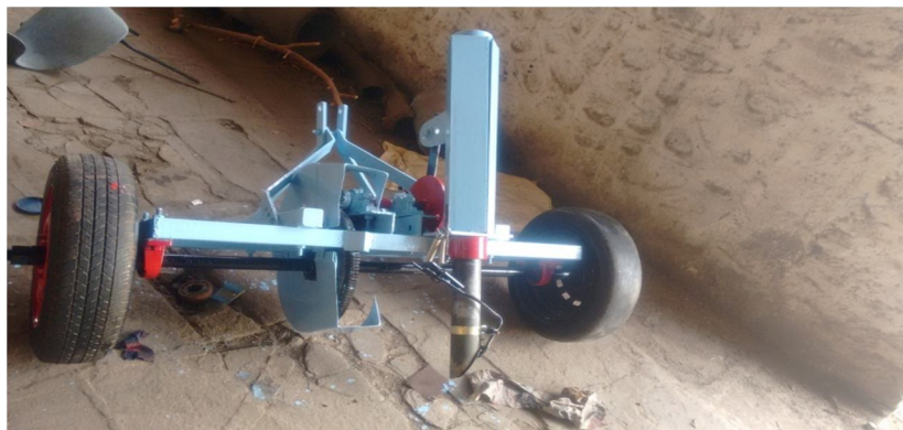
Fig. VIII: Transplantation Machine

If connect rod is mounted on 75 mm for cam center then depth of punch is 15mm. If connect rod is mounted on 85 mm for cam center then depth of punch is 25 mm