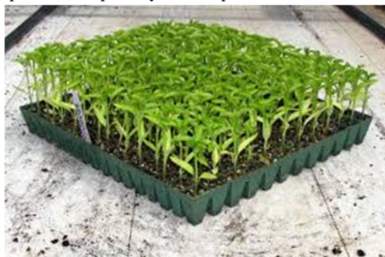
Fig. IV seedling tray