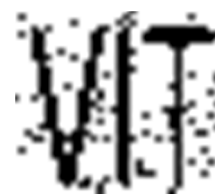
Fig. 5. Extracted Watermark