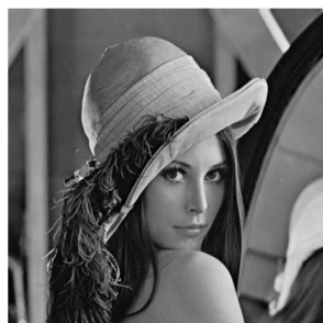
Fig. 4. Watermarked image