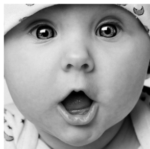
Fig. 8. Watermarked image