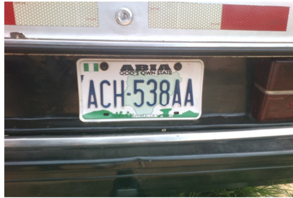
Figure 2. Input Image

In this step image is captured from digital camera. Image should be taken from fixed angle parallel to horizon. Vehicle should be stationary. Input image is shown in figure2.