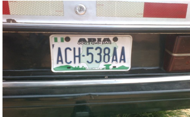
Figure5: The screenshot of the simulation

This section presents the simulation results of the developed ANPR system. Different images of cars having different colours and structure types are taken and stored in PC. The screenshot of the simulation is displayed below.