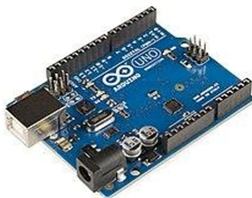
Fig 2: Arduino UNO