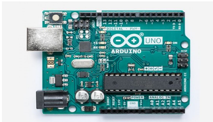
Fig.5 Arduino Uno with ATMEGA 328

The Arduino Uno is a microcontroller board based on the ATmega328 (shown in fig.5). Arduino is an open-source, prototyping platform. The Arduino Uno differs from all the other preceding boards that it does not use the FTDI USB-to-serial driver chip. Instead, it features the ATMEGA microcontroller chip programmed as a USB-to-serial converter. It contains everything needed to support the microcontroller.