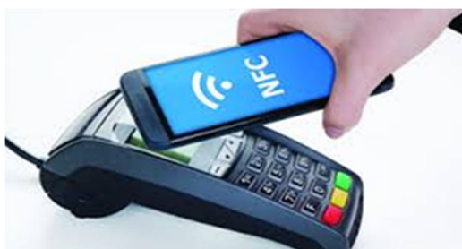
Fig. 4 Near field communication device

NFC technology enables simple and safe two-way interactions between electronic devices, allowing consumers to perform contactless transactions, access digital content, and connect electronic devices with a single touch. NFC complements many popular consumer level wireless technologies, by utilizing the main elements in existing standards for contact less card technology. [Y.Honget.al, 2015]