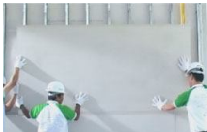
Fig. 6 Mounting of board on other side of frame.