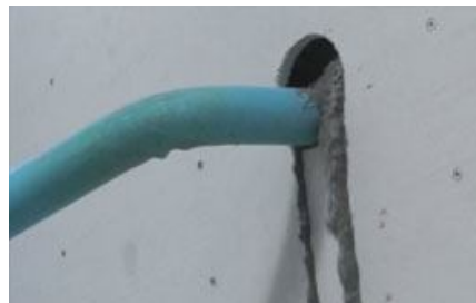
Fig. 7 Pumping light weight concrete from top