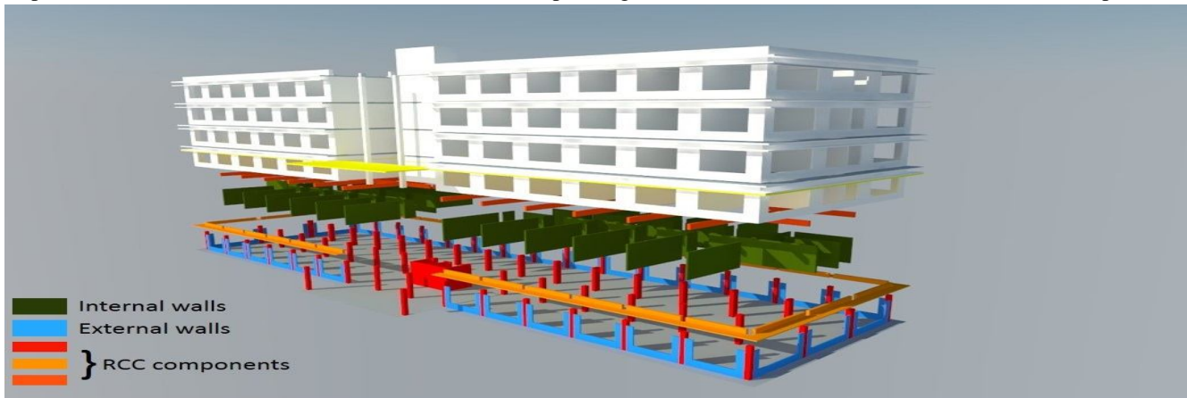
Fig. 11 G + 4 building showing components for estimation purpose.

The structure considered is a G+4 commercial building having a floor plate of 15000 sq.ft. Table II, III and IV show the estimate of constructing the cold shell structure (only RCC framework and walls). The module focuses only on the internal and external walls of the superstructure. The rates mentioned for each item corresponding to each material are inclusive of labour and transportation.