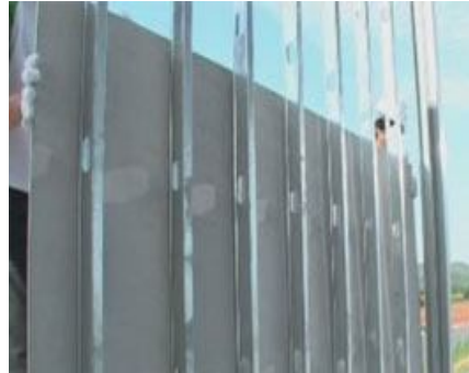
Fig. 4 Mounting 8mm SHERA board on one side