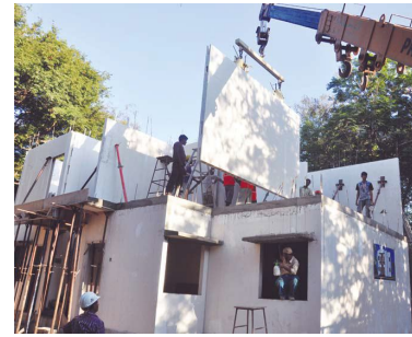
Fig. 2 Installation of a GFRG panel