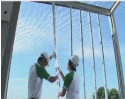
Fig. 3 Fixing steel frame in position.

Figures 3 to 8 show the six step process of installing SHERA infill walls.