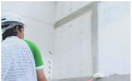
Fig. 8 Finishing of joints with Shera PU sealant.