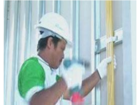
Fig. 5 Installing services.