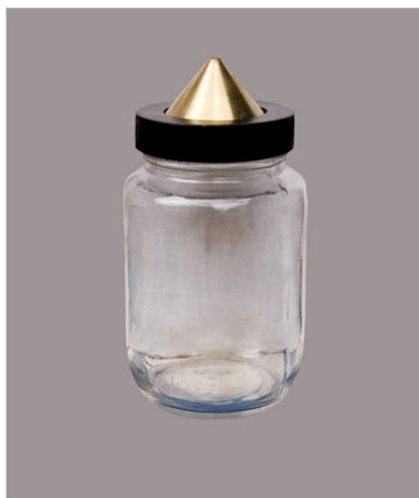
Fig 3.3 Specific gravity of Bottom Ash pycnometer

Pycnometer would be filled with distilled water and clean the exterior surface of pycnometer with a dry and clean cloth. Weight of pycnometer & contents that is W_3 would be determined. Make the pycnometer empty to clean it. It would be filled with distilled water to mark. Clean exterior surface of pycnometer would be cleaned with dry and clean cloth. Weight of pycnometer & distilled water, W_4 would be determined. Empty the pycnometer & clean it. This test is conduct under specification of IS: 2720 (part IV) – 1985.