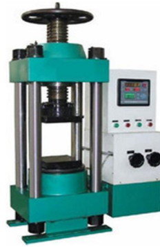
Fig 3.6 Compression Testing Machine