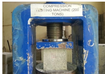
Fig. 3.7 Compression Testing