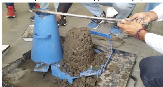
Fig 3.11 Slump Test Procedure

The slump test should take approximately 2,5 min.