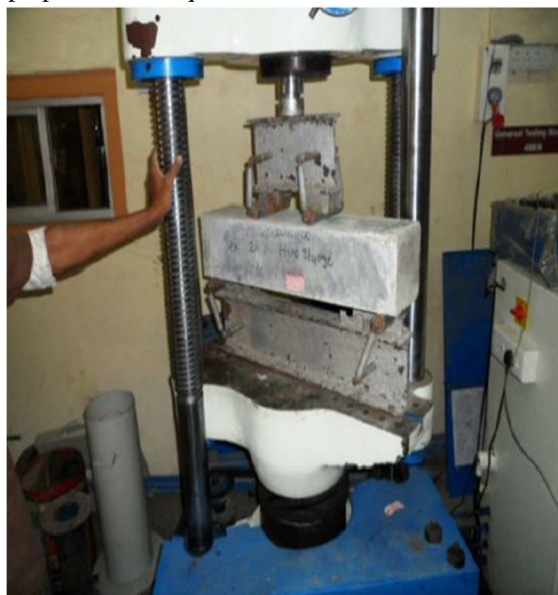
Fig 3.8 Flexural Testing Machine