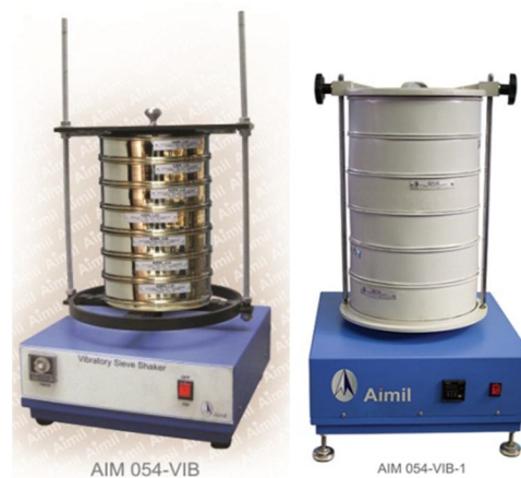
Fig 3.2 Sieve analysis of Fly Ash

3) Procedure for Fly Ash Sieving: The procedure for Fly Ash sieving is same as for Bottom Ash. There is only one exception that it is done on a larger scale. The measures of the sieves used for Fly Ash sieving are 30 cm in diameter & sieve aperture sizes used are 40mm, 20mm, 10mm, 4.75 mm .The pan are shown in (Figure 3.4). A bigger mechanical shaker was operated for 10-15minutes, a little longer than for Bottom Ash sieving; and same methodology is followed as for Bottom Ash sieving.