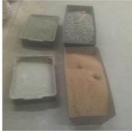
3.13 Weighting material

2) Preparation of Concrete: A 100 liters capacity tilting drum was used to mix materials. The mixing procedure was carried out as described in SP 23-1982 Hand Book on Concrete Mixes. Prior to first batch of each mix pan was moistened so that free-water was not lost to pan. The mixer was also thoroughly cleaned out between mixes.