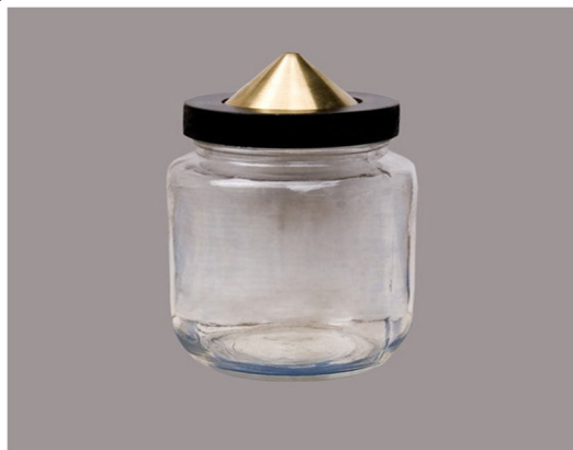
Fig 3.4 Specific gravity of Fly Ash pycnometer