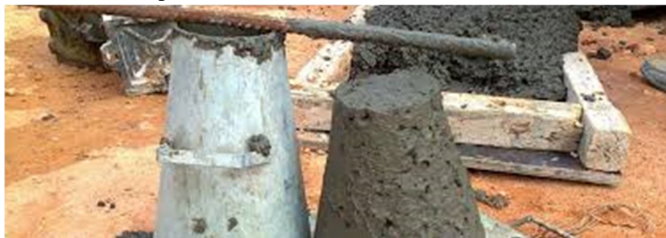
Fig 3.10 Testing for concrete workability

The procedure for slump test is as follows