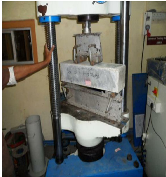
Fig 3.8 Flexural Testing Machine