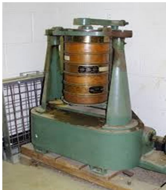
Fig 3.1 Sieve analysis of bottom Ash (B.K. Satish & Ganesh 2014)

Then the volume retained on each sieve was measured & shown as a percentage of total samples. The total percentage was then compared with grading requirements given in IS 383-1970, Specification for Coarse & Bottom Ash from Natural Sources for Pavement.