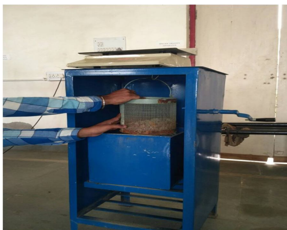
Fig 3.5 Wire Bucket Method

C = Weight of oven dried aggregate in air.