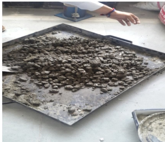
Fig 3.14 Ingredient mixing

3) Casting & Compaction of Concrete Samples: After mixing, concrete mix is casted into cube moulds of 15×15×15 cm for compressive strength. The cube is coated with a thin layer of a water-based release agent from inside to facilitate demoulding of samples after curing. The compaction of fresh concrete was carried out by using sixty hits per layer with a rod. Fresh concrete was placed in three layers in each cube & cylinder. Each layer was compacted by tamping rod for compaction. To prevent the loss of moisture, the moulds are covered in plastic sheets. The covered moulds are then transferred to curing room for 24 hours which was preset before start of curing at elevated temperatures.