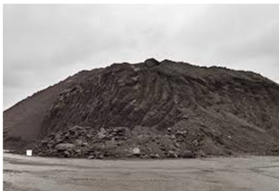
Fig 1.5 Bottom ash