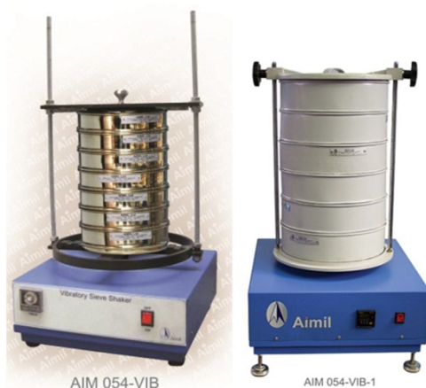
Fig 3.2 Sieve analysis of Fly Ash

3) Procedure for Fly Ash Sieving: The procedure for Fly Ash sieving is same as for Bottom Ash. There is only one exception that it is done on a larger scale. The measures of the sieves used for Fly Ash sieving are 30 cm in diameter & sieve aperture sizes used are 40mm, 20mm, 10mm, 4.75 mm .The pan are shown in (Figure 3.4). A bigger mechanical shaker was operated for 10-15minutes, a little longer than for Bottom Ash sieving; and same methodology is followed as for Bottom Ash sieving.