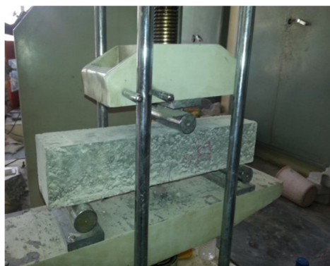
Fig. 3.9 Flexural Testing