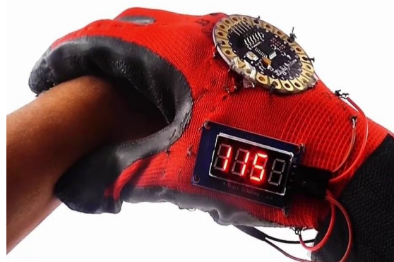
Fig. 3 Glove

In this project we are using Arduino micro controller to develop IoT based application. For elderly persons, Help to You (H2U) is developed that measures heart beats and blood pressure of the person is measured continuously. Pressure sensor measures the pressure and Systolic and diastolic pressure is calculated. The heart beats are measured by Heart beat sensor. If heart beats or Blood pressure become abnormal, SMS is sent to doctors or family members along with current location of that person. Location is tracked by using GPS modem. Buzzer also sounds at that time. The parameters of the person are displayed on the webpage that can be accessed from anywhere.