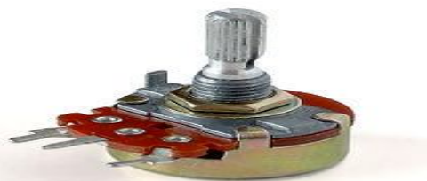
Fig 3. Potentiometer