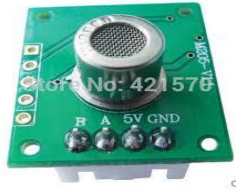
Fig 2. Electronic Nose

We have connected Electronic nose to microcontroller as an input and the Fan is connected to the microcontroller as an Output. The Electronic nose will sense the gas and gives signal to the controller as per the value set by coder.