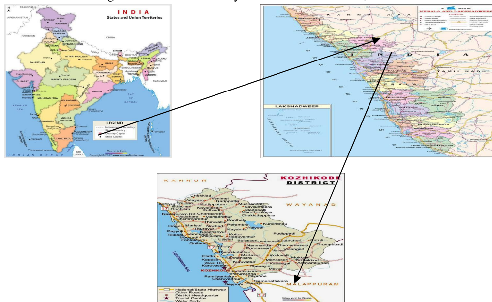
Figure 1: Location of study area- Vallikkattu Kavu, Kerala