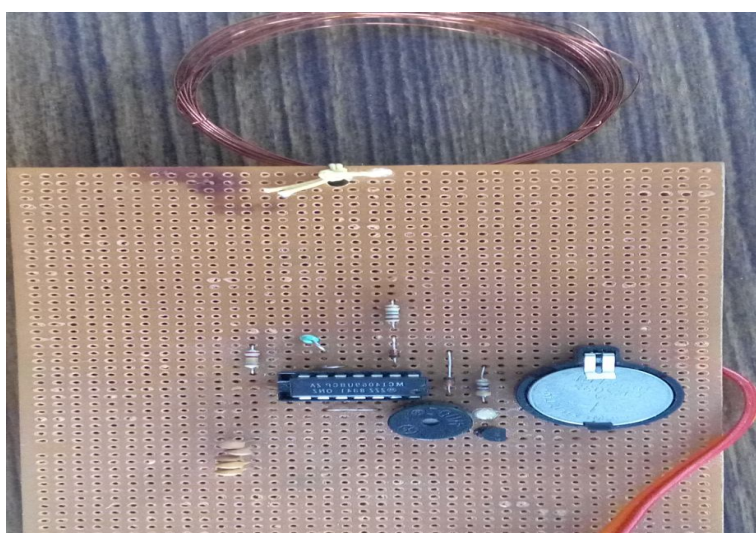
Figure 3 Accident Prevention System

The hardware setup of Accident Prevention System is shown in Figure 3. This setup is designed as proximity device in which coil is used to sense the flux produced by the current carrying devices when the supply is turned OFF. If the change in flux produced in the coil then the EMF is induced, the buzzer will give the sound to prevent the worker from touching the shorted wire. It will work for 20-25 cm.