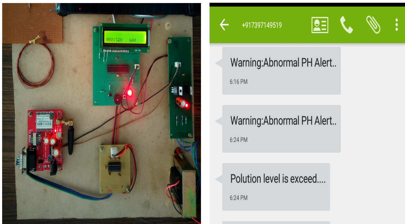
Figure 2 Hybrid Pollution Monitoring System

The hardware setup of the hybrid pollution monitoring system is shown in the Figure 2. The air pollution sensor placed at the top of the industries where the outlet of smoke is situated, connected to the controller via the driver circuit and the pH sensor placed at the outlet of industrial waste water is connected to the controller directly. The supply to the microcontroller turned ON then the value of sensors are shown in LCD display. If the value of air pollution exceeds 300 and pH sensor value exceeds 7, the message will be sent to the owner then to the government. This paper is executed by using the lighter which produce smoke and the wastewater from industries.