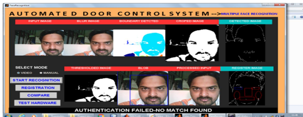
Fig. 1 Authentication Fail

As discussed below, the experimental results depicted are, the system successfully identifies the face from captured image and indicates whether it is authenticated or not as shown in fig 2. If authenticated person is recognized, door gets opened as shown in fig 3.