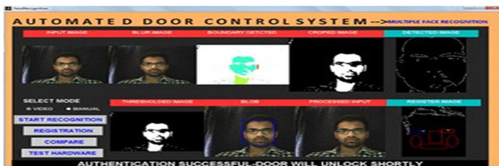
Fig. 3 Authentication Successful