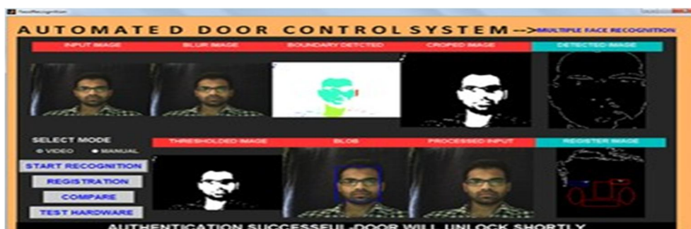
Fig. 3 Authentication Successful