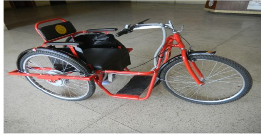
Fig (2); - This is a semi advanced tricycle which runs by electric energy but the disadvantage of this cycle is that this tricycle does not come in reverse direction.