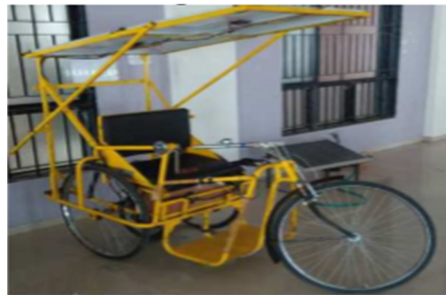
Fig (3); - This is a solar operated tricycle which run by a solar energy but it also not come in reverse direction.