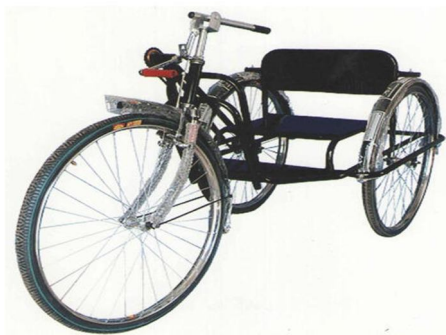
Fig (1); - Normal handicapped tricycle

This is a normal tricycle which is operated by human hand power which required high human effort. it cannot come reverse or we can say that this is a basic type of tricycle who has only motion in forward direction.