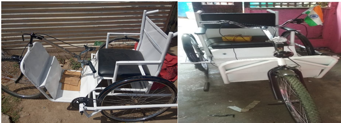
Fig (4); - Tricycle which is operated by electric energy as well as it come in reverse direction by the help of removable lever.