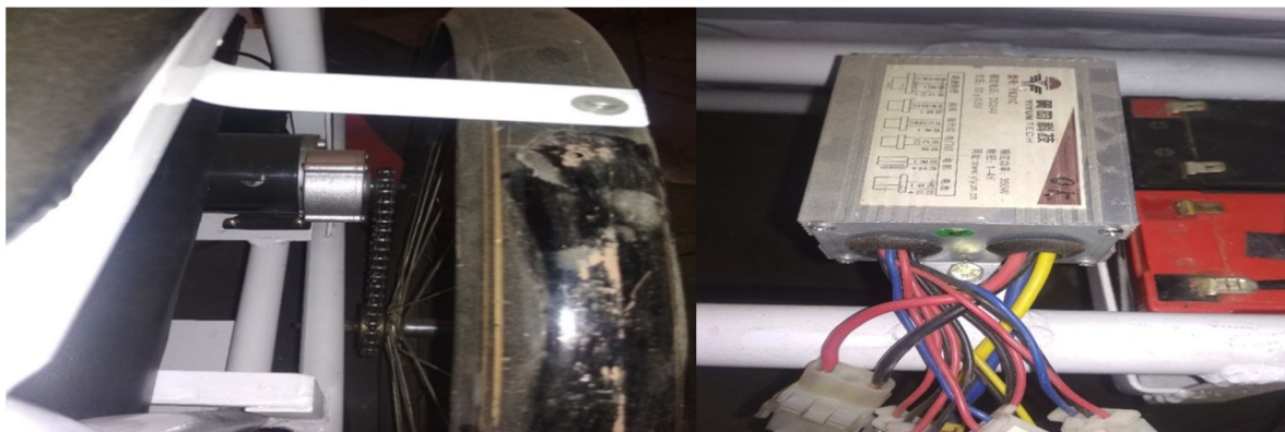
Fig (5); - Connection of motor gear and freewheel by chain Fig (6);- Controller