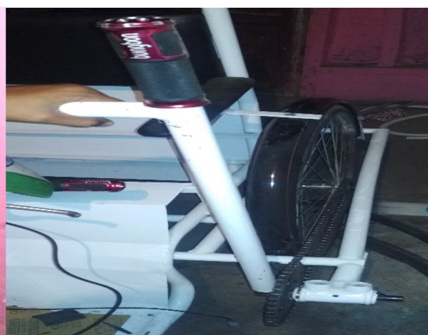
Fig (8); - hand lever of reverse mechanism.