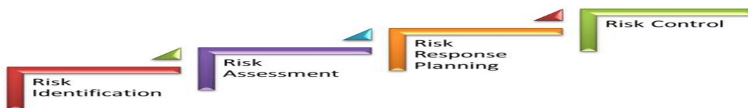
Figure: 1 Risk Management Process

Risk management is the process which consists of identification, assessment, response, control as shown in figure no. 1.