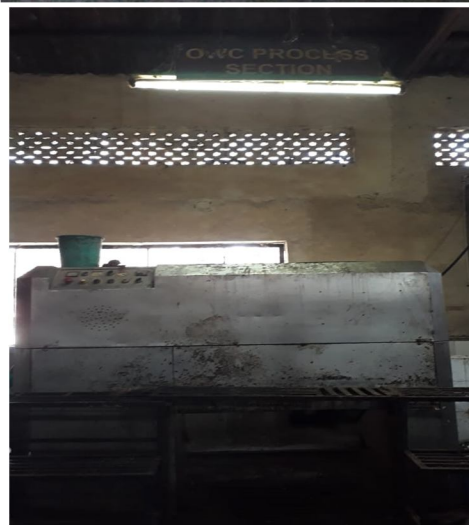
Food waste shredder