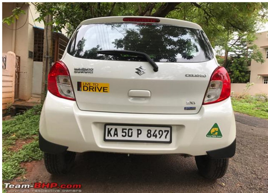
Fig. 2 Image Capturing Diagram

In this module we create a basic infrastructure to establish the proposed feature of image handling in python. Prepare the python environment to access video input device, in this case a camera. Familiarizing the image handling library called openCV for python.