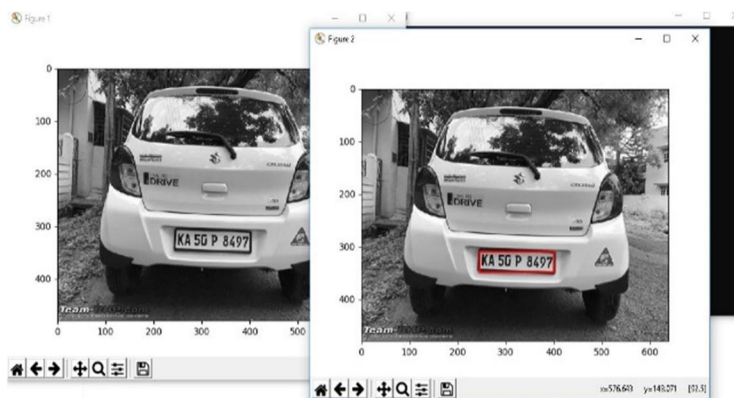
Fig. 3 Gray Scale Image