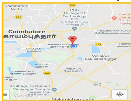
Plate 1: Location Map