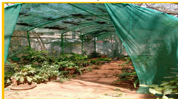
Plate 2: Study Area