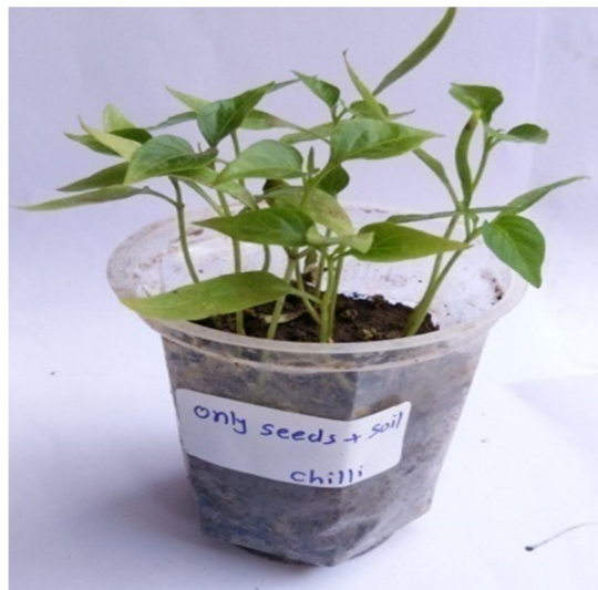
Fig.4 plant growth of seeds without treatment