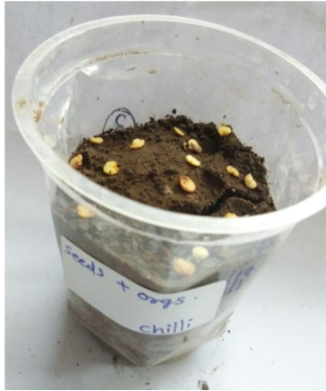
Fig.2 seeds sowed with microbial consortium.