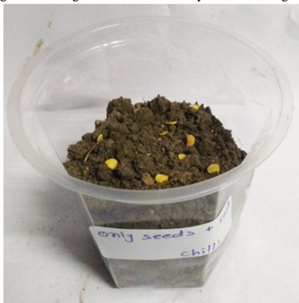
Fig.1 seeds sowed without treatment of microbial consortium.

In the present study the seeds Figure 1, Figure 2 and Figure 3 shows the 1 st day of seed sowing.