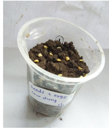
Fig.3 seeds with microbial consortium and cow dung.