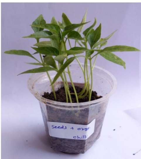
Fig.5 plant growth of seeds with microbial consortium.