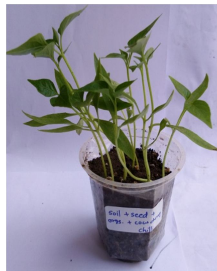
Fig.6 plant growth of seeds with microbial consortium and cow dung.

The figure 5, figure 6, and figure 7 shows the plant growth after 28 days of seeds sowing.