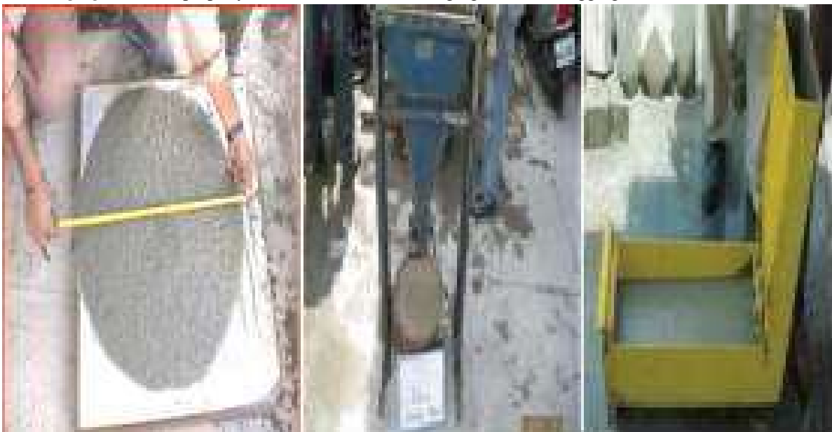
Fig. 1: Slump Flow, V-Funnel, l-Box Test

3) Resistance to Segregation : The property of SCC to flow without segregation of the aggregates.