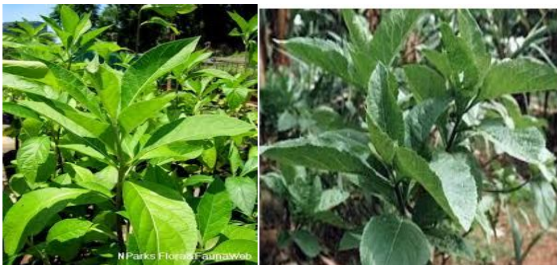
A) Habit of Vernonia amygdalina

A lot of plant research is ongoing in various fields of plant development and improvement. A part of the plant (known as an explant) is usually taken and grown under controlled ( in vitro ) conditions. The necessity of crop improvement and development is due to the reasons most plants have highly beneficial properties for humans and animals, such as nutritional and medicinal benefits. Some species of plants are being discovered and studied in order to figure out how beneficial they are in pharmaceuticals and drug development, foods and other industries 5 . The essence of plant research is basically to improve human health and subsequently provide sustainable better living conditions for all in the society. Plants, since time immemorial have been known to be a good source of food and nutrition. They have also been considered to have various bioactive compounds which enhance the immune system in the fight against infections and diseases 3 . Many of these bioactive compounds have been categorized and classified, while research is still in process to discover more of these compounds or sub-compounds which act against pathogenic microbes and protozoans 4 .