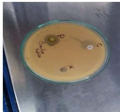
Figure 2: Antimicrobial potency of V. amygdalina against B. Subtilis