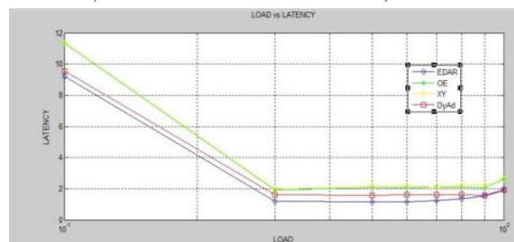
Number of keyword in W (a)

Essentially, the constructed verification object is the Bloom Filter, which can incur the false positive. This means that our scheme may cause incorrect query results to pass the correctness verifications. To numerically evaluate the verification accuracy, we first define several verification events. Given a returned query results set R w of the query keyword w and corresponding verification object V Ow , for each result c 2 R w , if a verification Event occurs, then the Event is set as 1, obviously,