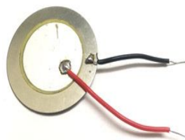
Figure 2-Piezoelectric Sensor

The piezoelectric sensor is a device which can convert pressure into voltage. The output of piezoelectric sensor is in AC form ,It is converted into DC by using Full Bridge Rectifier.