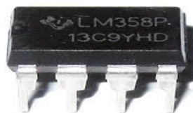
Figure 3-LM358P IC

Full bridge rectifier is used to convert AC to DC.