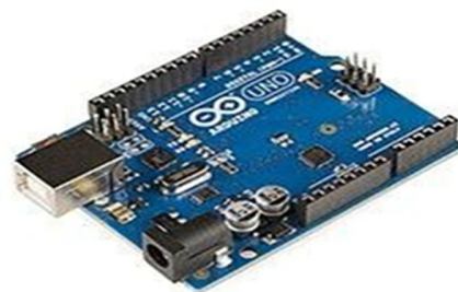
Figure 1-Arduino UNO