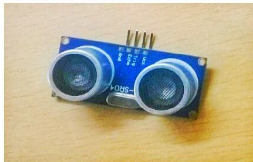
Figure 3:- Ultrasonic Sensor