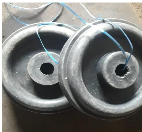
Figure 4 :- Wheels