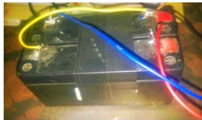
Figure 2:- 12 V Battery