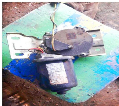
Figure 4:- DC Motor