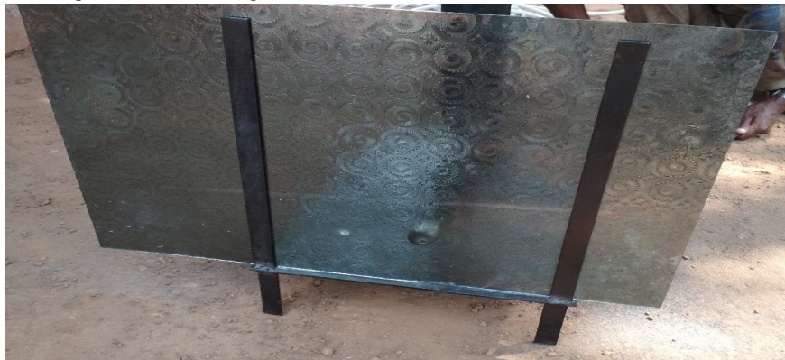
Fig. 4 Experimental conditions

The abrasive jet machine is carried by high pressure and high velocity which is used to impinge on the work interface. This eliminates tool to metal contact, which are the main criteria of unconventional machining method used in this machining process. The parameters which affect the material removal of the workpiece are abrasive particle size and type, standoff distance, mass flow rate of abrasive, nozzle diameter, abrasive jet velocity and carrier gas pressure. The carrier gas attains a maximum velocity at the exit of the nozzle, but abrasive particles being heavier than air tend to lag behind and attain maximum velocity at some distance away from the nozzle exit. Therefore, it is seen that material removal rate increases with an abrasive flow rate. The grain size of abrasive reduces the stand of distance at which material removal occur increases slightly. This fact is because of increase in density of the finer abrasive particles than courses particle [1, 3, 14-15]. Figure 4 shows the experimental conditions during AJM and figure 5 shows the machined holes on glass material using AJM.