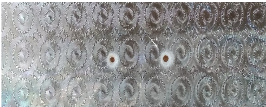
Fig. 5 Machined holes on glass material using AJM