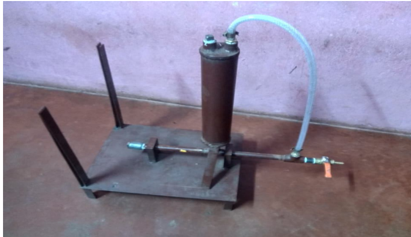
Fig. 3 Fabricated portable abrasive jet machine