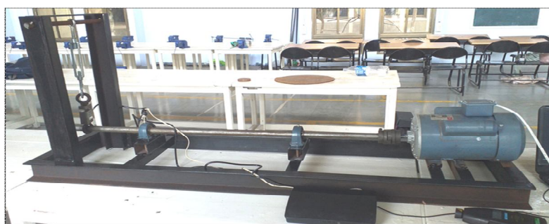
Figure 1. Photograph of experimental setup (Laboratory)

An experimental setup is employed in this research to collect the vibration signals for two purposes: to study the vibration signatures generated by incipient bearing faults, and to verify the techniques to be developed. This experimental setup is shown in Figure 1. The system is driven by a 1-hp induction motor, with the speed range between 20 and 4200 rpm. The shaft rotation speed can be controlled by a speed controller. An optical encoder is used for shaft speed measurement. Thus, the shaft rotation speed is known directly from the reading of this speed controller, which can be further verified by applying the FT on the signals from the optical encoder. A flexible coupling is utilized to damp out the high-frequency vibration generated by the motor. Two ball bearings are fitted into the solid housings. Accelerometers are mounted on the housing of the tested bearing to measure the vibration signals along two directions. Considering the structure properties, the signal that is vertically measured is utilized for analysis, whereas the signal that is horizontally measured is used for verification. A static load and variable load are applied by load suspended mechanism. A data acquisition board is employed for signal collection. Technical Specifications of different parts are mentioned in table 1.