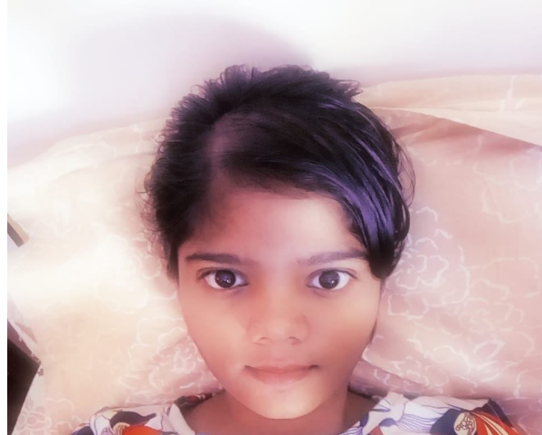
Fig.-face with contempt expression

Besides all of these there are many micro expressions which are real challenges for digital video processing & major task to develop data set for comparison.