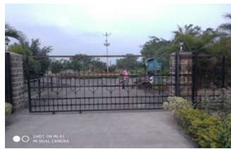
Fig 2. Automatic gate case study

Pravara Rural Engineering College's North campus gate has length of 6000mm and width of 2000mm and weight of 125 kilogram is under consideration for case study.