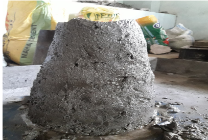
Fig 4: slump cone test