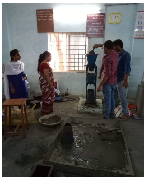
Fig 3: Conducting workability tests