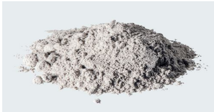
Fig 1 : Waste Paper Sludge Ash