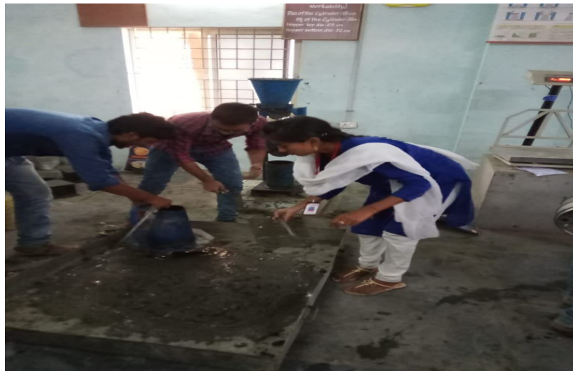
Fig 2: Conducting workability tests