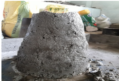
Fig 4: slump cone test