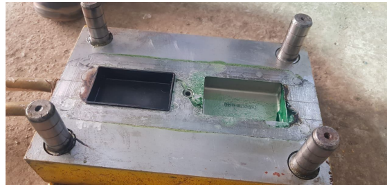
Fig.2. Plastic mould