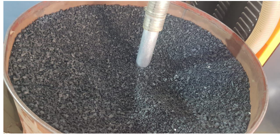
Fig.1. HDPE material