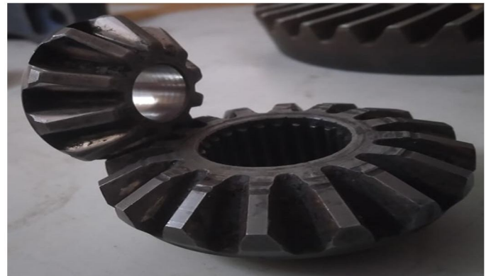
Fig4: Straight Bevel Gear