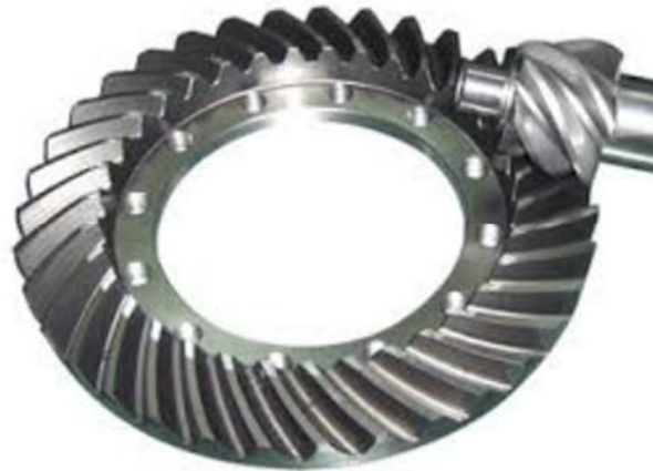
Fig2: Hypoid Bevel Gear