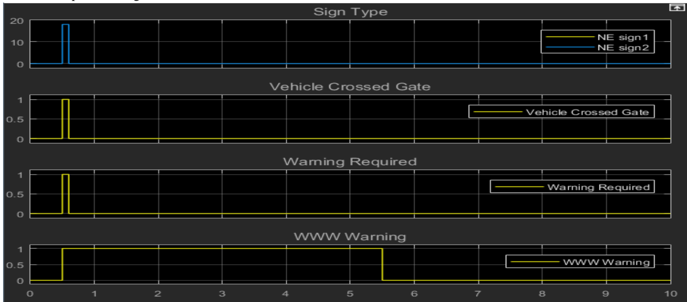
Fig. 2 Plot showing the input and output

Keeping the WWW feature enabled, the model was tested in MIL testing environment by feeding two NE signs and vehicle allowed to cross the NE gate. The sign type value for NE sign is 18. So, a warning is expected to be generated once the vehicle crosses the gate. Model was calibrated to ‘Warning Hold for Time’ mode so that warning will sustain for 5 secs which is specified in the model. Test result is captured in Fig.2 .