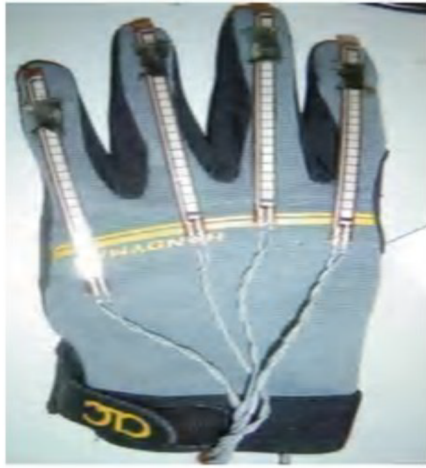
Fig. 3 Sensor attachment to the glove

movement of the fingers and the thumb which is later transmitted into voice signal.