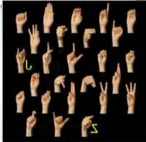
Fig.4 Performance of degree of bend