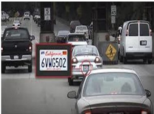
Fig (1) LPR

In the proposed system we have used Open Computer Vision, which is much better than MATLAB. OpenCV can be used for real-time applications. The main component analysis algorithm is used for resource extraction. The classification is done through the classifier called Convolution Neural Network, which is used to recognize the characters.