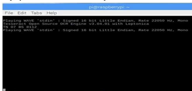
Fig (13) Output Window

The characters are recognized and displayed on the monitor, the output is the characters on the license plate.