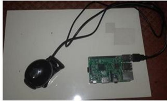
Fig (6) Hardware