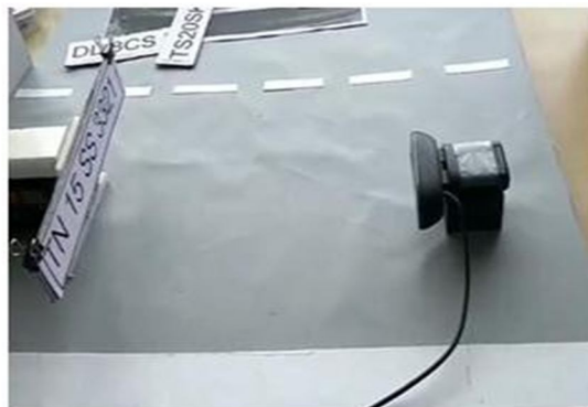
Fig (9) License Plate Image is captured (Modal)

The camera, which is connected to the Raspberry Pi, captures the car's image in front and processes the instant detection and recognition of the vehicle's license plate. We enter an image of a car that goes through the stages of image preprocessing and improves image quality for better results in the later stages. The input can be in the form of an image or a video. The process is done online, in other words, it leads to real-time entry to the domains.