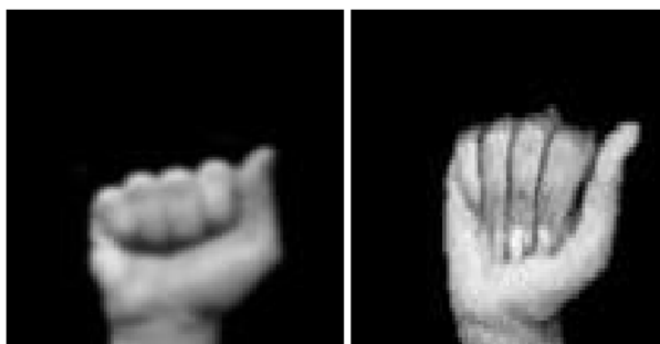
Figure 4: Testing Image