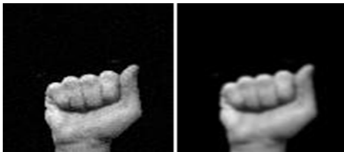
Figure 3: Training Images

An example is shown below. In the first row are the training images. In the second, the testing images.