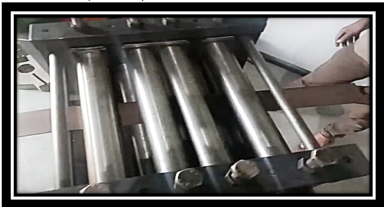
Fig. 1 Sheet Straightening