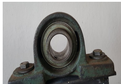
Fig. 3. Solid Bearing