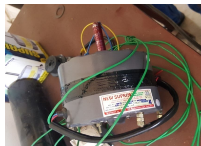
Fig. 5. DC Motor