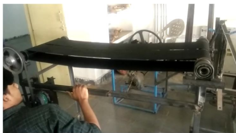
Fig. 7. Magnetic Separator

diameter with bearing internal diameter through a intermediate part which is also drilled to match the both alignments. The total assembly depends on steel as primary equipment for supporting and holding the parts, not only this but also as mandatory rotators material. For putting all those things together the welding process is made to weld all the parts along for convention the equipment and materials. The connections are first made to the motor which was welded on the frame. Moreover, the bearings were connected to the motor by means of the shaft presented. One side of the shafts is feuded with a donut type magnets and filled up all through the shaft rod. While the other is placed and welded along with bearing to a hollow rod for maintaining the belt rotation . A conveyer belt is made to connect the two shafts as one of the shafts has magnets on it the belt is made to cover up the magnetic shaft. At the end of the belt and under the machine the buckets were put to collect the magnetic metals as well as the non magnetic materials. The motor has a specification of 0.5 hp direct current input, as the speed of the motor to be adjusted to the required value and for achieving better separation efficiency regulators has been added to control the over all speed. And to regulate the amount of the current supply to the driver motor.