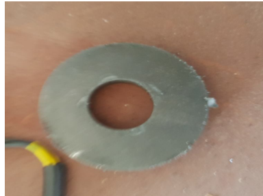
Fig. 1. Magnets