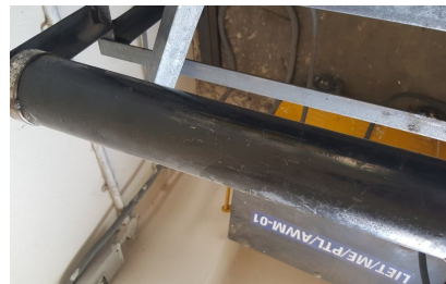
Fig. 4. Circular Cylinder