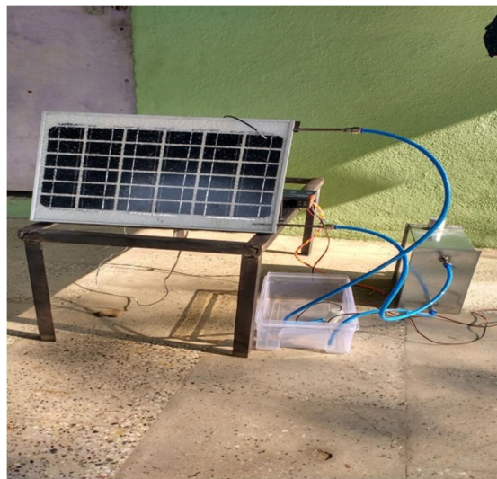
Fig 2 Photography