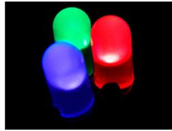
FIG: RGB LED

confined to red. Progressed LEDs are open over the detectable, splendid, and infrared wavelengths, with high shine [8].