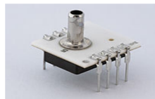
FIG: Pressure Sensor

A weight sensor measures weight, routinely of gasses or liquids. Weight is an announcement of the force expected to keep a fluid from broadening, and is for the most part communicated the extent that power each unit zone. A weight sensor by and large goes about as a transducer; it delivers a sign as a limit of the weight constrained. For the reasons of this article, such a sign is electrical. Weight sensors are used for control and checking as a piece of an extensive number of normal applications. Weight sensors can moreover be used to in an indirect manner measure distinctive variable, for instance, fluid/gas stream, speed, water level, and rise. Weight sensors can then again be called weight transducers, weight transmitters, weight senders, weight markers, piezometers and manometers, among distinctive names.