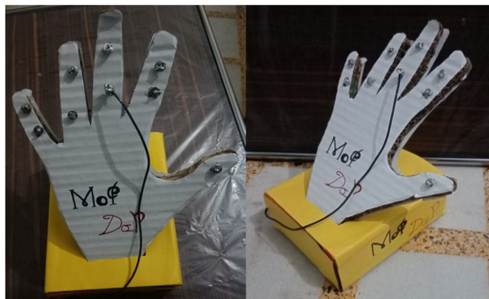
Fig 5 MopDop Device

When a person wants to communicate with speech disabled persons, deaf peoples, patients or old aged peoples they just simply have to connect their mobile phones with the MopDop device (shown in figure 5) using mopdop mobile application (shown in figure 6). Once the mobile phone gets connected they can now start a communication or conversation. The disabled persons choose a relevant touch point after that an image shown on the mobile phone screen with a message and virtual voice. In this manner they can make a conversation between themselves and with other persons also.