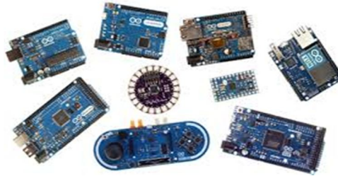
Fig. 1 Arduino Boards