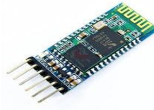
Fig. 2 Bluetooth Module