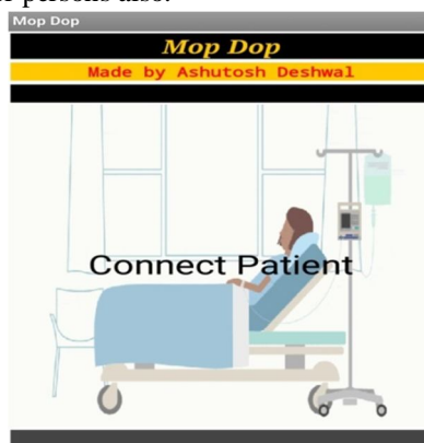
Fig. 6 MopDop Mobile Application

When a person wants to communicate with speech disabled persons, deaf peoples, patients or old aged peoples they just simply have to connect their mobile phones with the MopDop device (shown in figure 5) using mopdop mobile application (shown in figure 6). Once the mobile phone gets connected they can now start a communication or conversation. The disabled persons choose a relevant touch point after that an image shown on the mobile phone screen with a message and virtual voice. In this manner they can make a conversation between themselves and with other persons also.