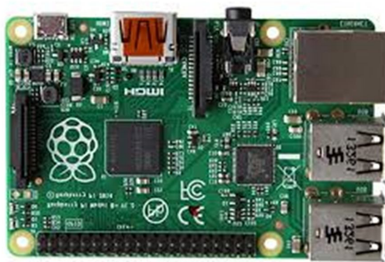
Figure 2: The Raspberry Pi Model