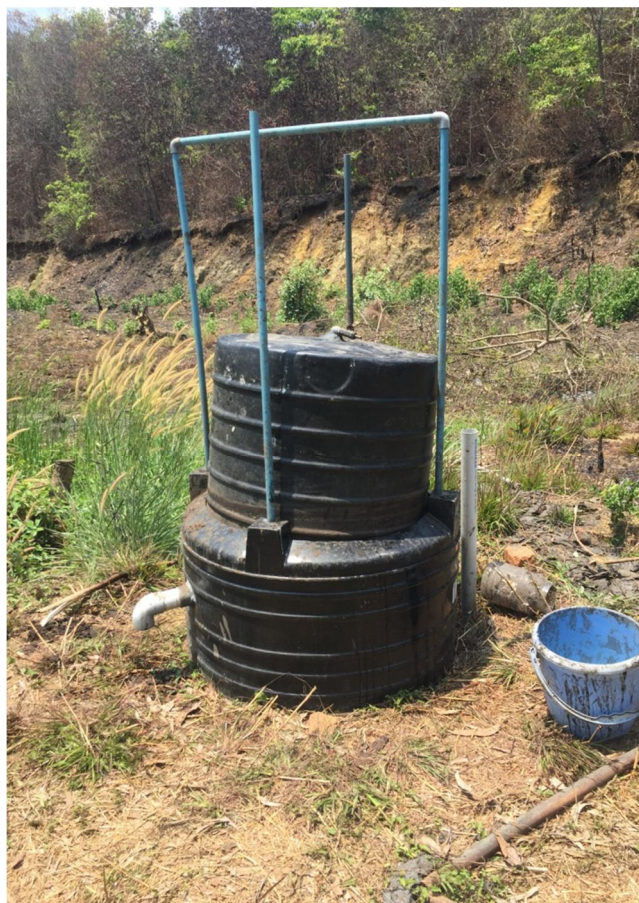
Fig: Installation of Biogas plant in our institute capacity about 750 liters under in progress.