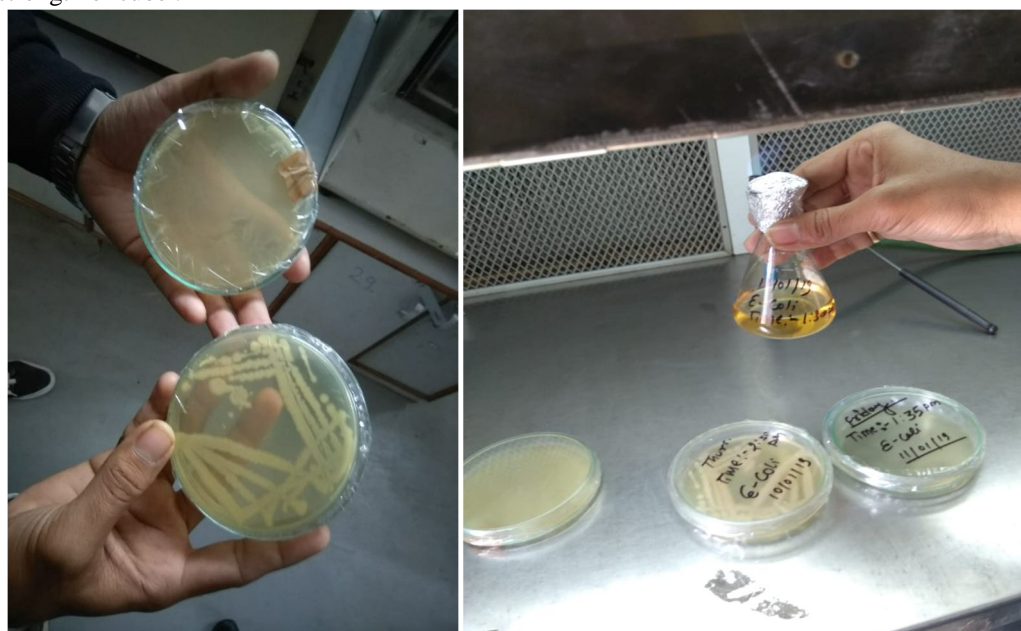
Figure 1 : E-coli bacteria growth

E-coli was cultured in LB media and colonies are grown in nutrient agar . Different dilution of microbial culture was prepared in various proportion ie, 1:10:: 1:100::1:1000 and incubated for 18 hours . then optical density of each diluted microbial culture was measured by using spectrometer at nanometers . in cement mortar the micro cracks upto .2 to .4 mm wide are healed homogeneously due to hydration of non – reacted cement .if excess amount of water which is not contributing in hydration process may be consume by the bacteria so this reduce the water cement ratio in the mix leading to reduction in water cement ratio and result in increase of strength of cube .