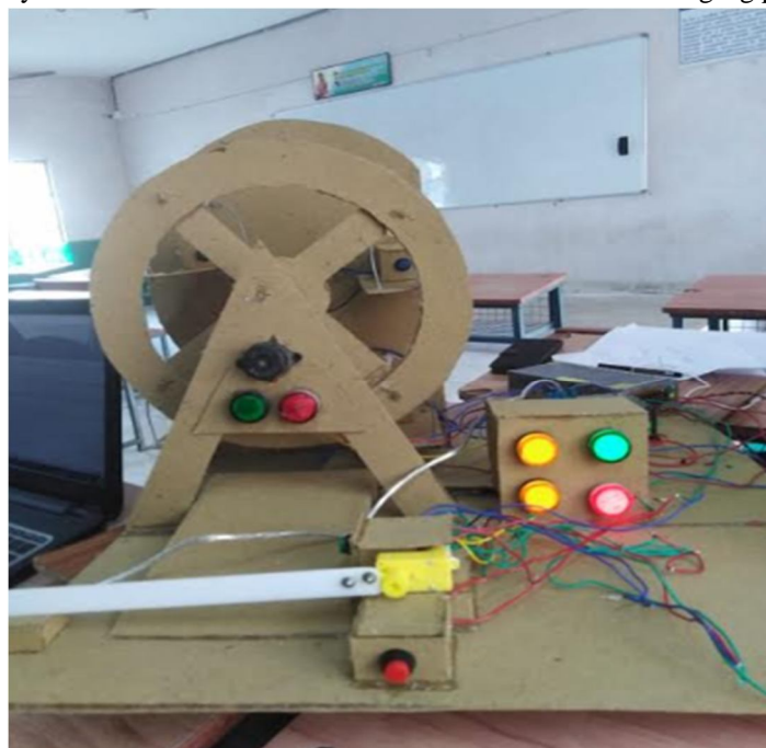
Fig (i). Layout of car parking system

When car is came to the parking basement at ground level our lift sensor is cut due to sense the car and give command to plc.it has already some program for this mechanism and controller given command after some time to motors relay and lift motor works at that time PLC operator given command to empty space location and due to this signal our lift slide to this area and slowly down motor operate and due to zigzag pattern our car is placed at those area of parking. When driver come to the PLC operator give command to PLC and lift take car from parking and put at exit gate. Dimension of one slot car parking basement is length*width*height is respectively 5000mm*2000mm*2000mm. Wheelbase distance for zigzag pattern is 2500mm-3500mm.