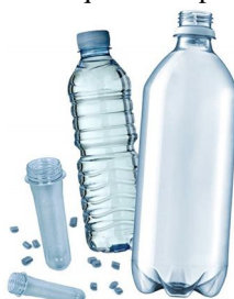
Fig 2 Normal bottle

The preform (parison) can be first manufactured in the Injection moulding and next that preform can be set in the blow moulding machine and give the compressed air and converted into the required shape.