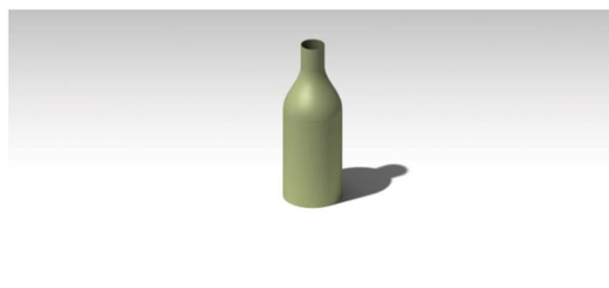
Fig 4 Designed PLA bottle