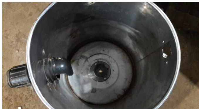
Fig3. Main mixing chamber

The mixing chamber used here is a cylinder 30 cm inner diameter and 50 cm length made of steel. Let us check whether the hoop stress lies within the allowable limit or not for safe working of the mixing chamber