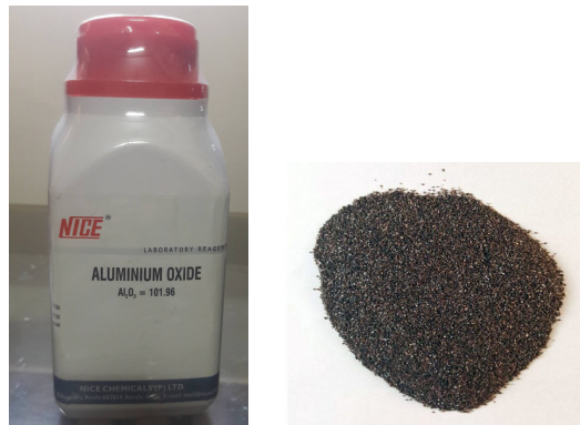
Fig2. Abrasive materials